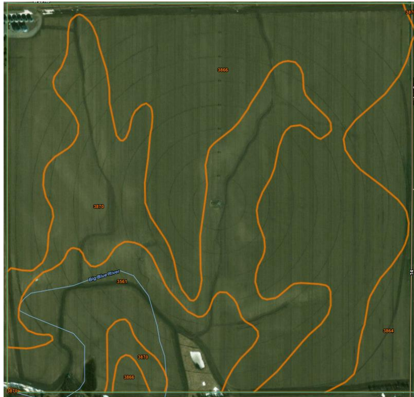
Hamilton County, Nebraska (NE081)